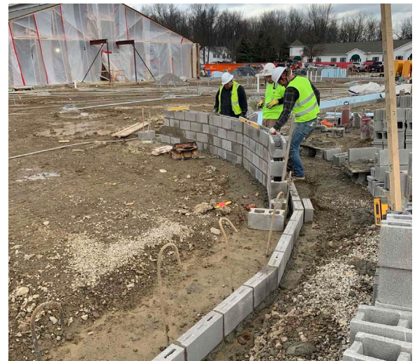
Starting work on the children's area

While we strive to keep the library open during construction, we may have to close or adjust the schedule for safety purposes throughout the project.