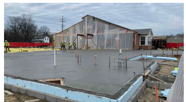
Concrete slab for south addition